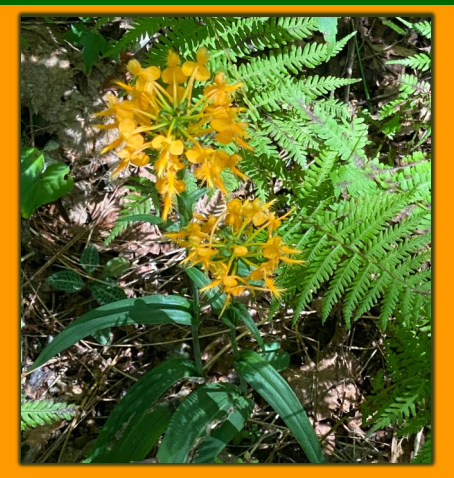
Yellow Fringed Orchid sighting.

We were in luck - - the trail was just cleared by our BMT maintenance team the past weekend. This section of trail is densely shaded at this time of year but during the winter, it has clear views of the Jacks River watershed.