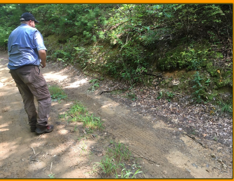
Here, snaky, snaky. Come to Daddy.