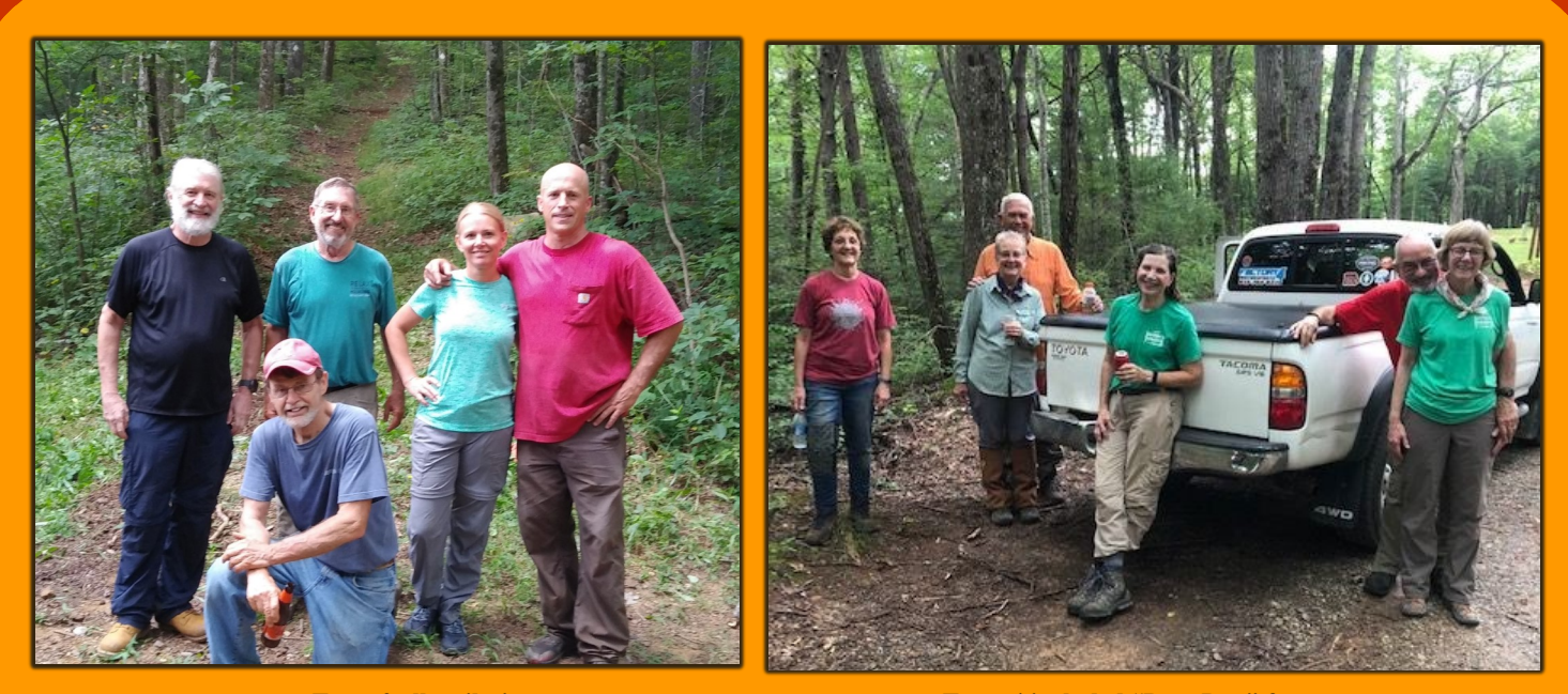
Team 2 all smiles!