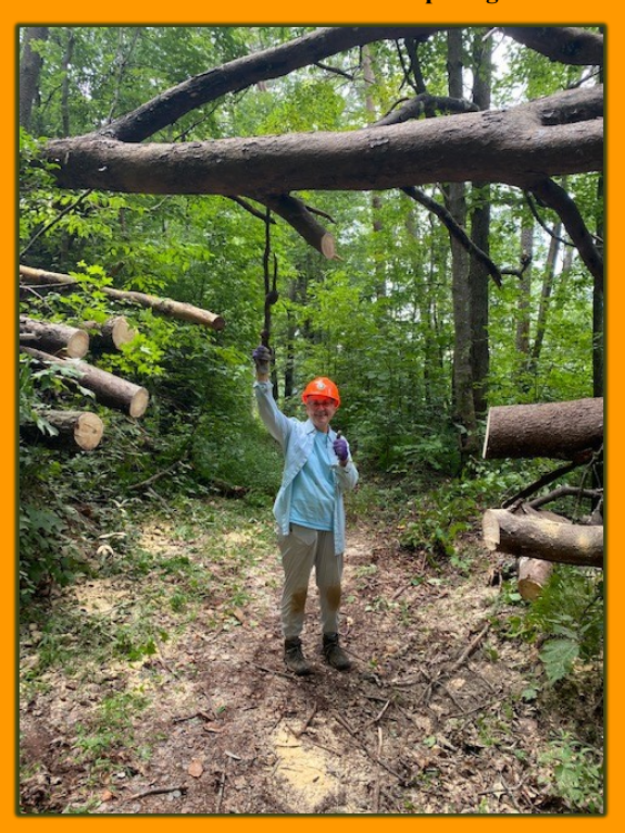
Yay! Thumbs up!