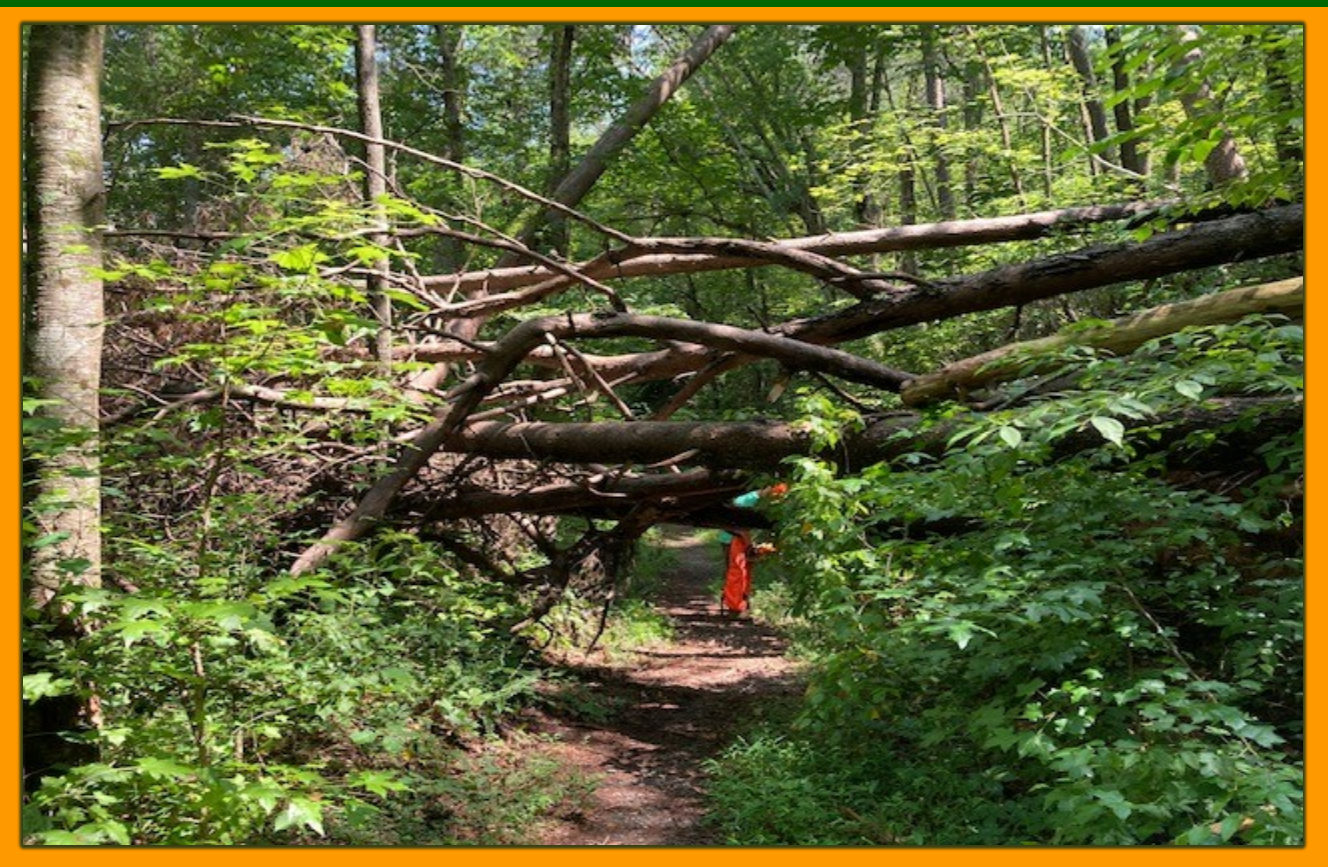
There in the deep lay the behemoth. The behemoth accepted sacrifices and rituals to allow safe passage.