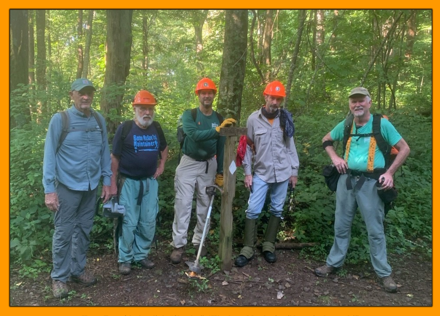
Hmm. Team 3 looks a little "Sketchy." "Watch out Ma, thar's wild men in the woods!"