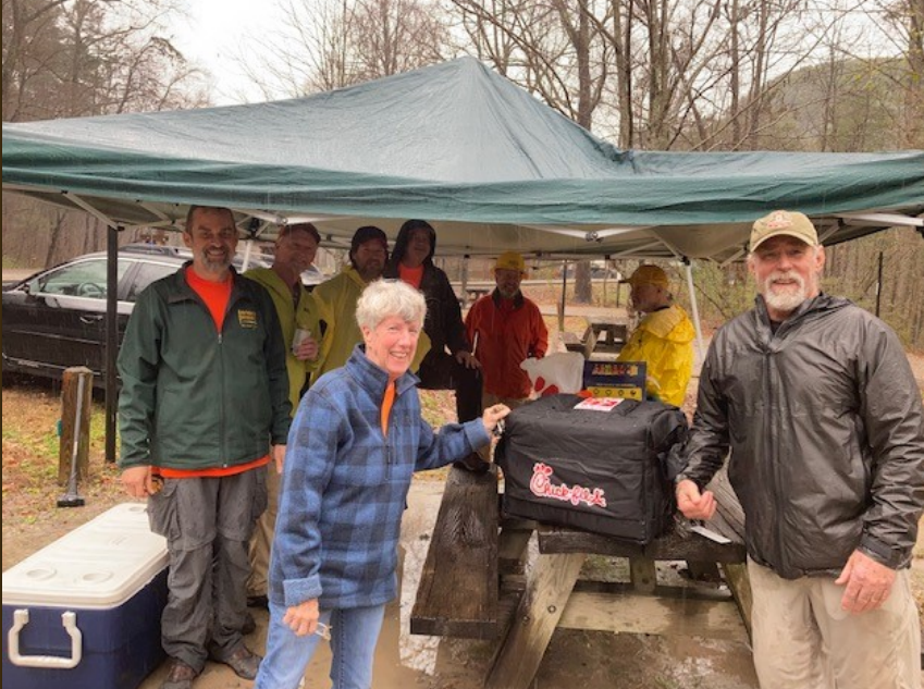
The satisfaction of a job well done!