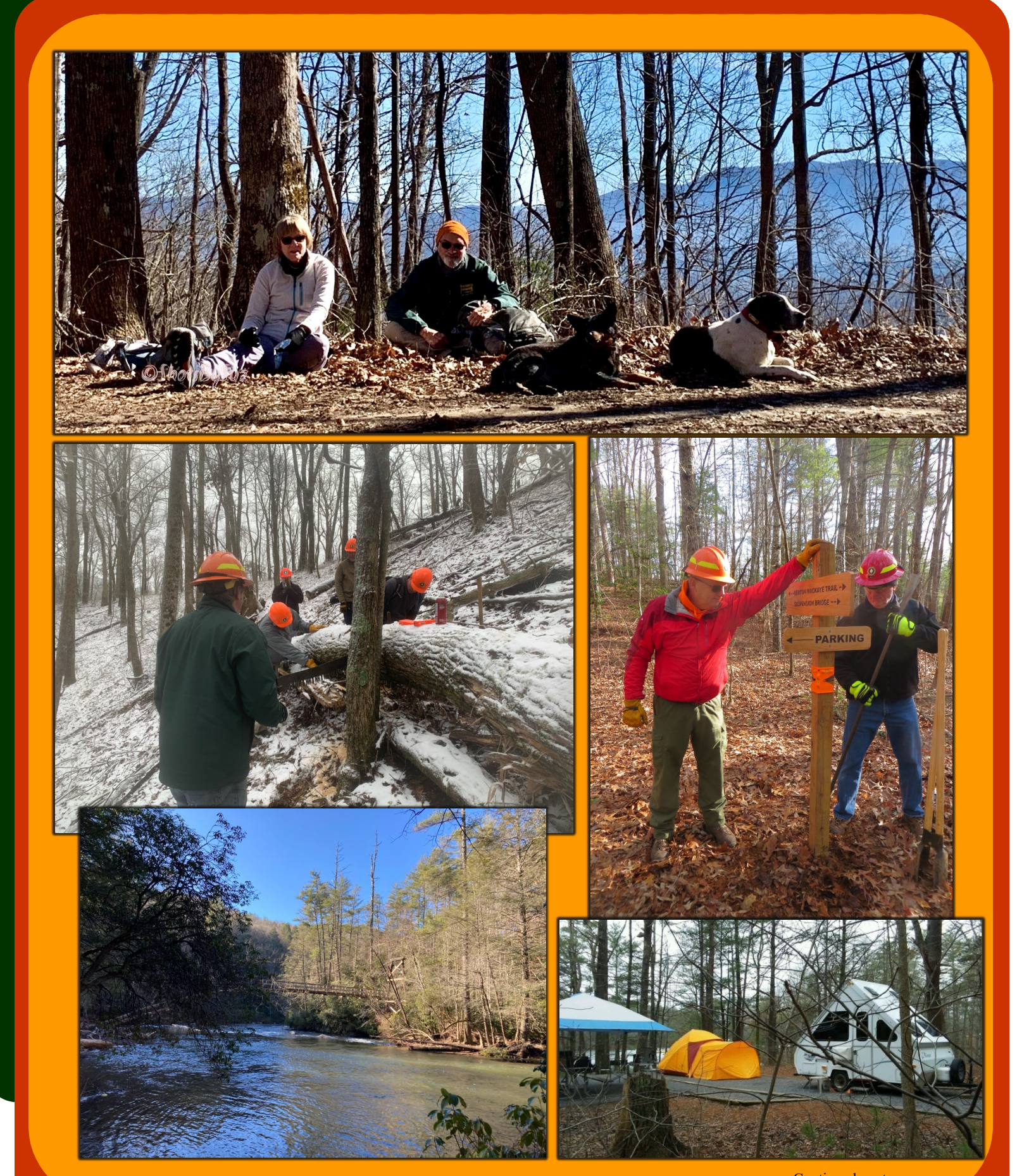
Continued next page