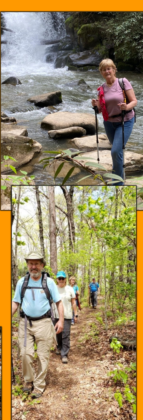
Continued next page