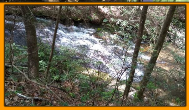
Continued next page