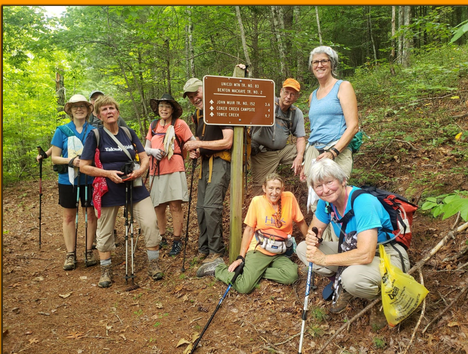
Continued next page