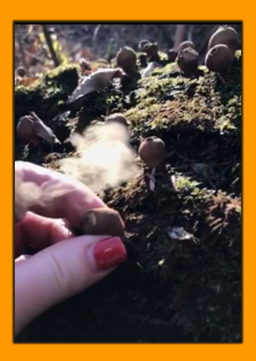
Minute puffballs!